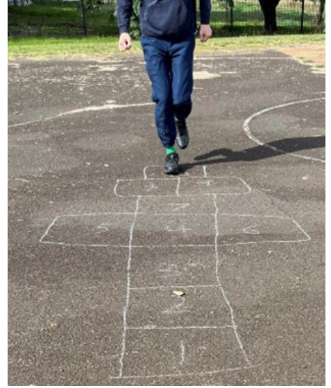
Yr 12 Numeracy class – learning about the Mathematics/Numeracy skills required in a variety of games.