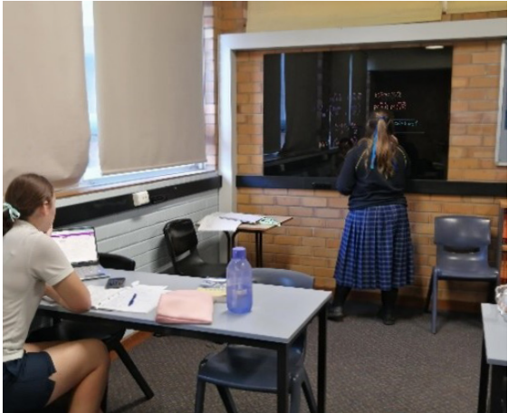
Yr 11 Mathematics Advanced class working collaboratively on a problem.