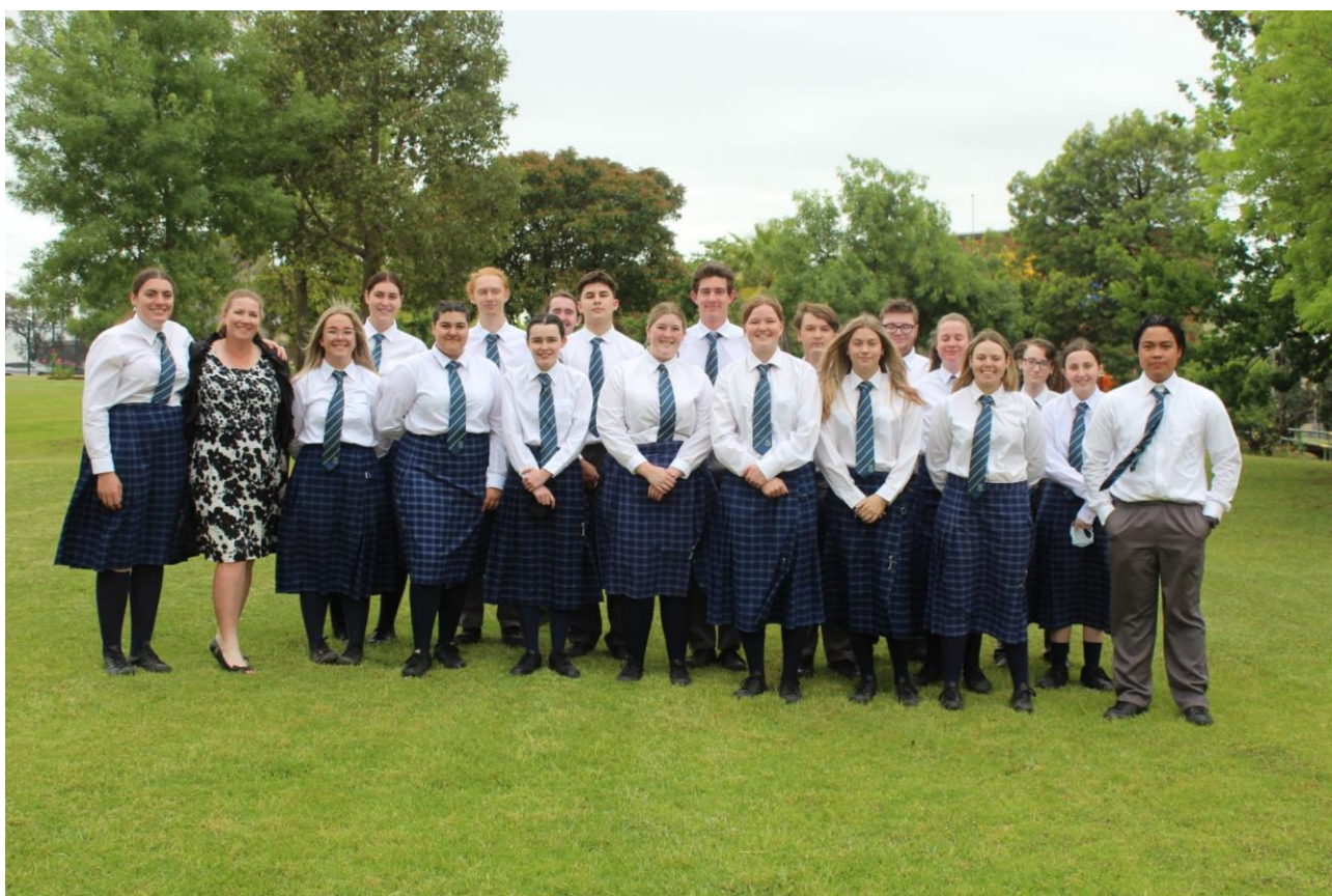
FHS Year 12 Students 2021

This week is the final week for year 12 onsite before they commence their Higher School Certificate examinations on the 9 th November. As I write this, we have all of the final preparations in place for our farewell event. We will record this event and share it with our families who are not able to be on site. We are excited for the formal graduation dinner when we can come together to celebrate the achievement of completing the Higher School Certificate.