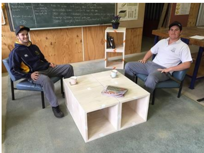
Reece Davie Project: Modular cubes that can be rearranged and locked together to form a coffee table, side tables or bookshelf.