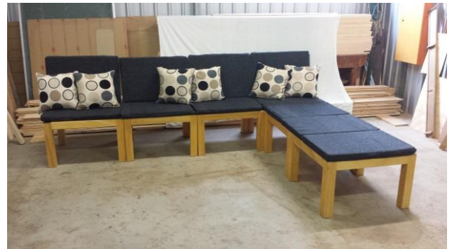
Isac Stewart – Modular Outdoor Setting