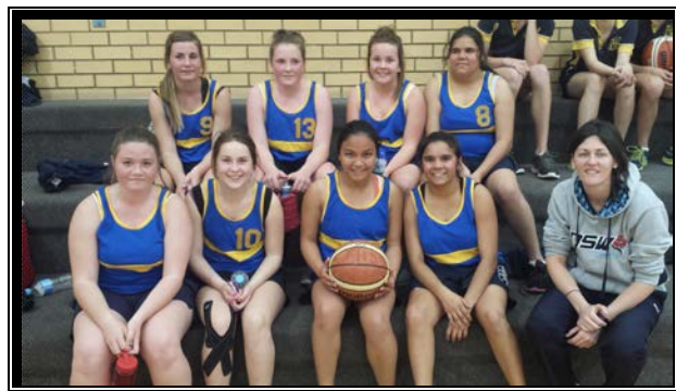
15 Years Girls Team