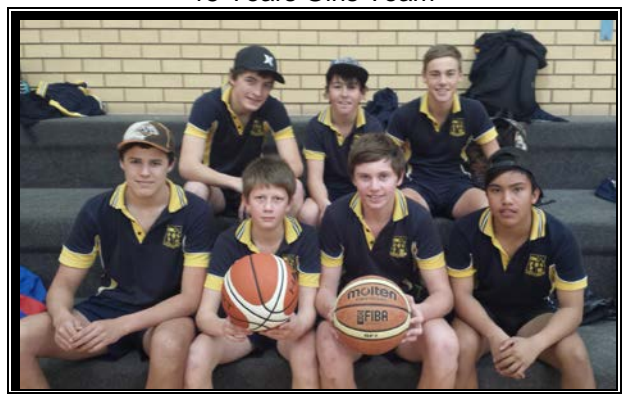
15 Years Boys Team