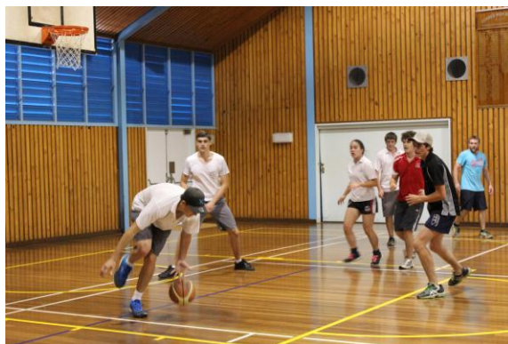
Mitchell makes a steal and takes the ball away from the danger zone