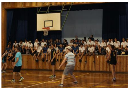
A large crowd came to cheer the teams on