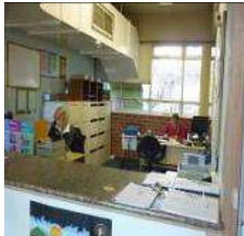
New reception area