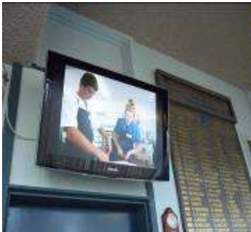
TV Front office display photos