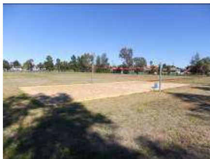
School Volleyball courts