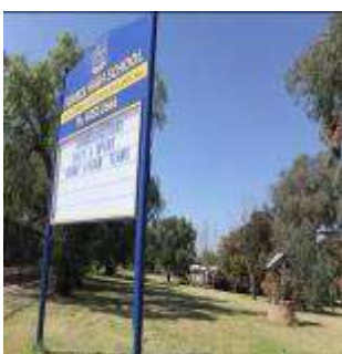
FHS Notice Board