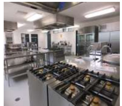
Trade Centre New Kitchen