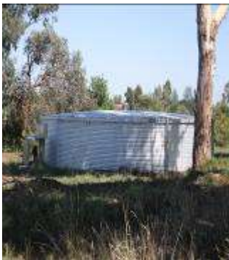
School Water Tank