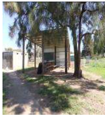
Ag Plot outside Class Area