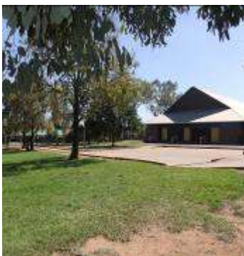
Forbes High School Hall