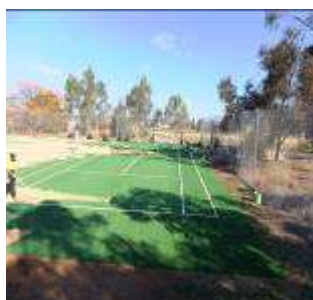
Tennis Courts Resurfaced